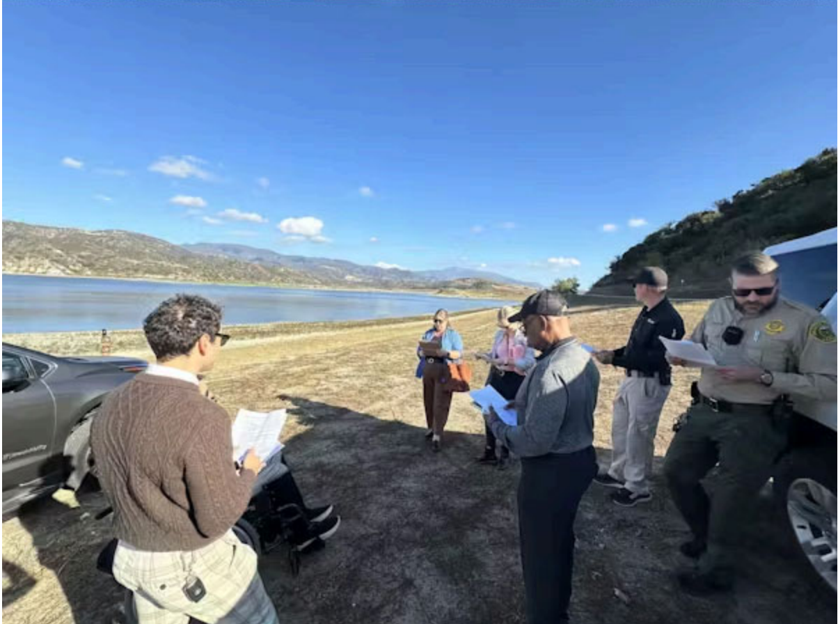
Last week, my staff joined Orange County Parks for a site inspection of Irvine Lake for our annual fishing derby coming up on December 6th!