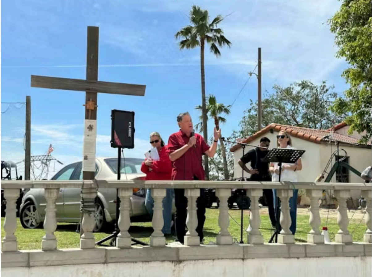
My staff and I joined Orange County's Catholic community at the Santiago Retreat Center for its annual Good Friday Stations of the Cross, commemorating